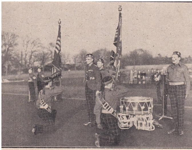
The Colours having been first presented.